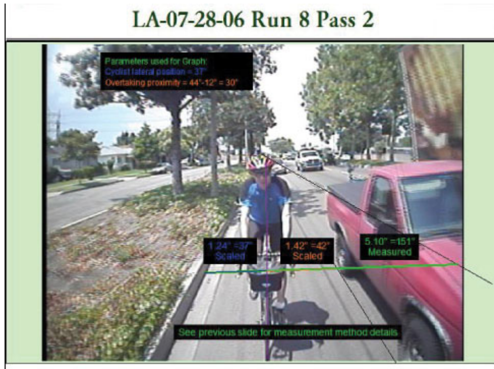
FIGURE 3 Example Still Image of Overtaking Maneuver with Measurements